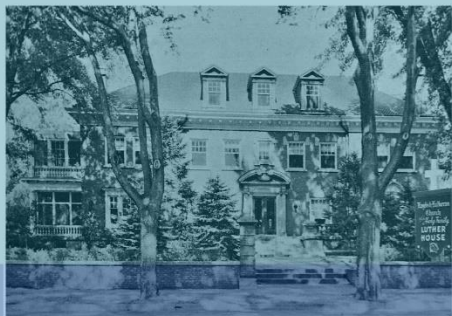
Luther House - 1953-1961