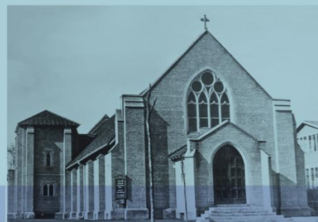
second building - 1925-1990